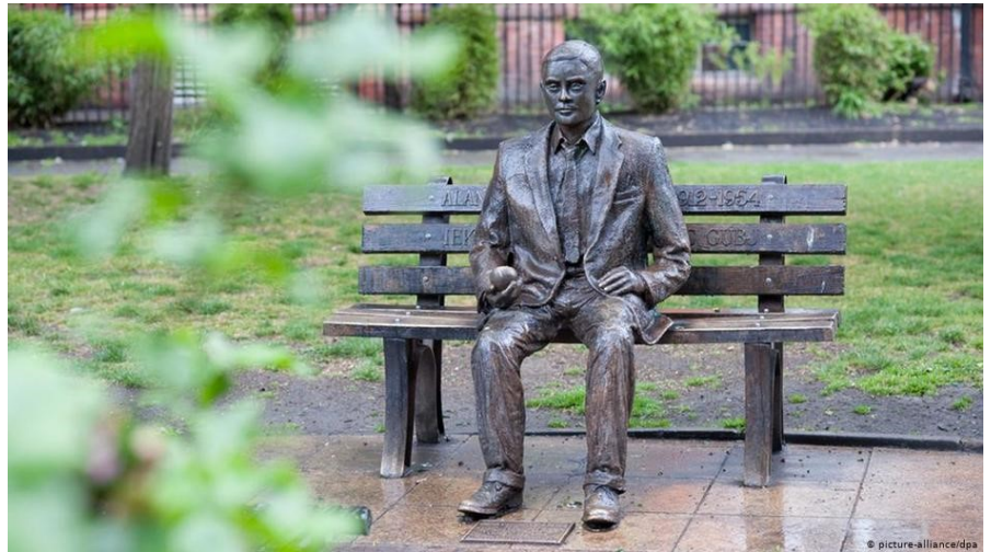
Alan Turing memorial bench—can you find out where it is?

'Sometimes it's the people no one imagines anything of who do the things no one can imagine'.