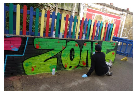
Above: construction of our new 'chill out zone' in the playground